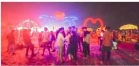
BACK TO THE DANCE FLOOR: There has been a "double-fold increase" in number of bookings for the New Year weekend, over and above pre-Covid times, says an industry insider.

Hotels and restaurants are gearing up for a full house during the New Year weekend, with current booking trends suggesting pre-pandemic levels. Occupancies are up 100-150 per cent across hotels with a 30 per cent growth in revenues. At the same time, restaurants are witnessing a surge in bookings for the New Year parties. This comes even amidst global concerns about a surge in Covid cases in markets such as China and Japan.