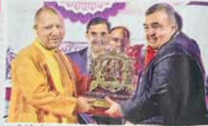
मुख्यमंत्री योगी आदित्यनाथ व अन्य वरिष्ठ अधिकारियों के उपस्थिति में पर्यटन विभाग का कार्यक्रम

आज के समय में पर्यटन को बढ़ावा देने के लिए हमें बहुत कुछ करना पड़ा है। हमें 300 करोड़ रुपये खर्च करने पड़े हैं। हमें पर्यटन को बढ़ावा देने के लिए हमें बहुत कुछ करना पड़ा है। हमें 300 करोड़ रुपये खर्च करने पड़े हैं। हमें पर्यटन को बढ़ावा देने के लिए हमें बहुत कुछ करना पड़ा है।