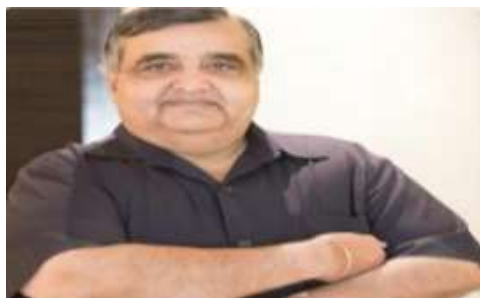
IATO hails Govt decision to scrap TCS on sale of overseas tour pac... IATO expresses its sincere gratitude to... www.bottindia.com

https://travelworldonline.in/Tour-Operators-news-detail.aspx?news=IATO-hails-Govt.-decision-to-scrap-TCS-on-sale-of-overseas-tour-packages-to-foreigners