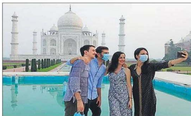
Tourists taking a selfie at the Taj Mahal.

However, terming it a partial relief, trade pundits continue seeking opening of the Taj