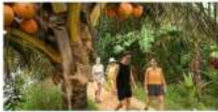
HOLIDAY SPREE. Ixigo saw a 62% surge in bookings and searches compared with the previous year, while EaseMyTrip and Cleartrip saw rise of 30% and 22%, respectively

Strategy at Cleartrip, said Delhi remains the top entry gateway to India, followed by Mumbai, Bangalore, Chennai/Madras, and Hyderabad.