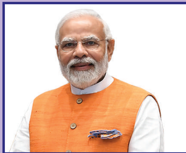
An appeal to the Hon'ble Shri Narendra Modi ji, Prime Minister of India requesting help for the Tourism Industry for revival of inbound tourism to India

Further IATO felt that either there was a shortage of staff at the ground level OR they were not fully trained and that needed to be looked into.