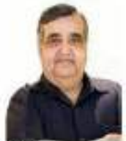
Rajiv Mehra President, IATO

MICE, adventure, eco and wedding tourism will continue to gain the momentum as investments in tourism infrastructure and destination development will be the desired agenda for the travel trade, Union government and states. Certain trends in 2023 that shall continue and stay relevant in 2024 is continuous address on hygiene and safety, staycations, and bleisure. There will be an integration of remote work and travel, with more people choosing to work with flexible options. Overall, there is a positive outlook and a lot of hopes for the upcoming year.