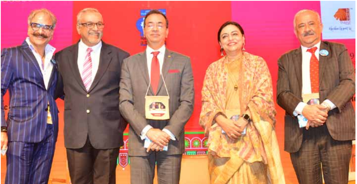
Panel discussion on 'Preparedness under the New Normal'

Working hand in hand is the key to moving forward, and it is necessary to make your presence felt outside India while keeping a united front.