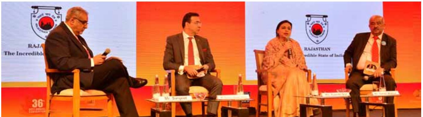
Brainstorming session on 'Preparedness under the New Normal'

of private content on the site. "We are also working with the heritage association. We would be happy to work with the trade because there must be a synergy. I am nothing without trade, and tourism is all about it. I would encourage everyone to come and work with us," she claimed.