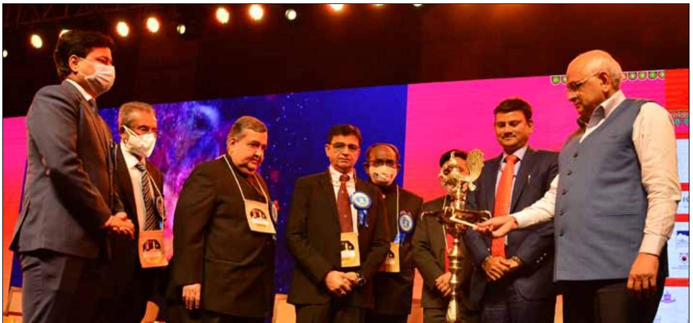
Inauguration ceremony of the 36th IATO annual convention held at The Leela, Gandhinagar

Bhupendrabhai Patel , Hon'ble Chief Minister of Gujarat, inaugurated the 36 th IATO Annual Convention. The ceremony was attended by senior dignitaries from Union Ministry of Tourism and Gujarat Tourism.