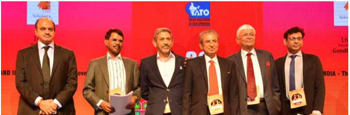
Session discussion on SEIS and the way forward

SEIS has been the biggest bone of contention throughout the year between tour operators and the government. However, after a lot of persistence, industry got its SEIS dues, although at a much lower rate than expected. A session titled 'SEIS: New Policy under FTP' delved deeper into the issue.