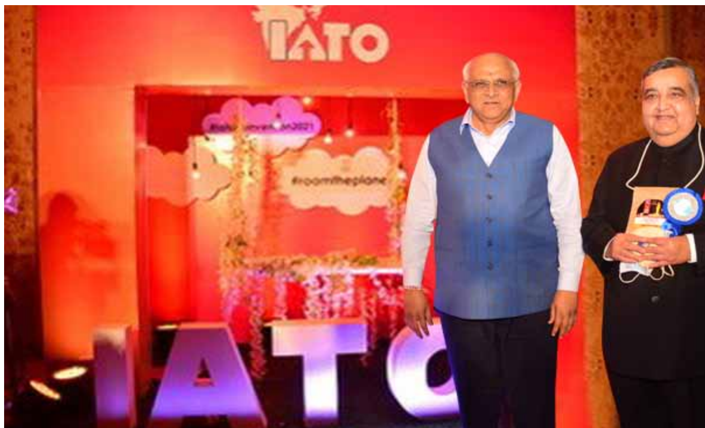
Bhupendrabhai Patel, Hon'ble Chief Minister of Gujarat, arrives at the 36 th IATO Convention in Gandhinagar

He mentioned, “The convention will see discussions taking place over the theme ‘Brand India - Road to Recovery’. Owing to the pandemic, the tourism industry has been impacted. Now it is time to go towards recovery. Whether it is tourism, agriculture or business, we must turn this setback of COVID-19 into a comeback. While business must have taken a hit, it is human nature to keep moving. International tourism to Gujarat started owing to the efforts of Hon'ble PM Narendra Modi when he was the Chief Minister of Gujarat. He gave a new concept of Festival Tourism in Gujarat to the country and the world at large. Festivals such as International Kite Festival, Navratri Mahotsav, Tarnetar Festival, Saputara Monsoon Festival, Beach Festival, Kankaria Carnival and