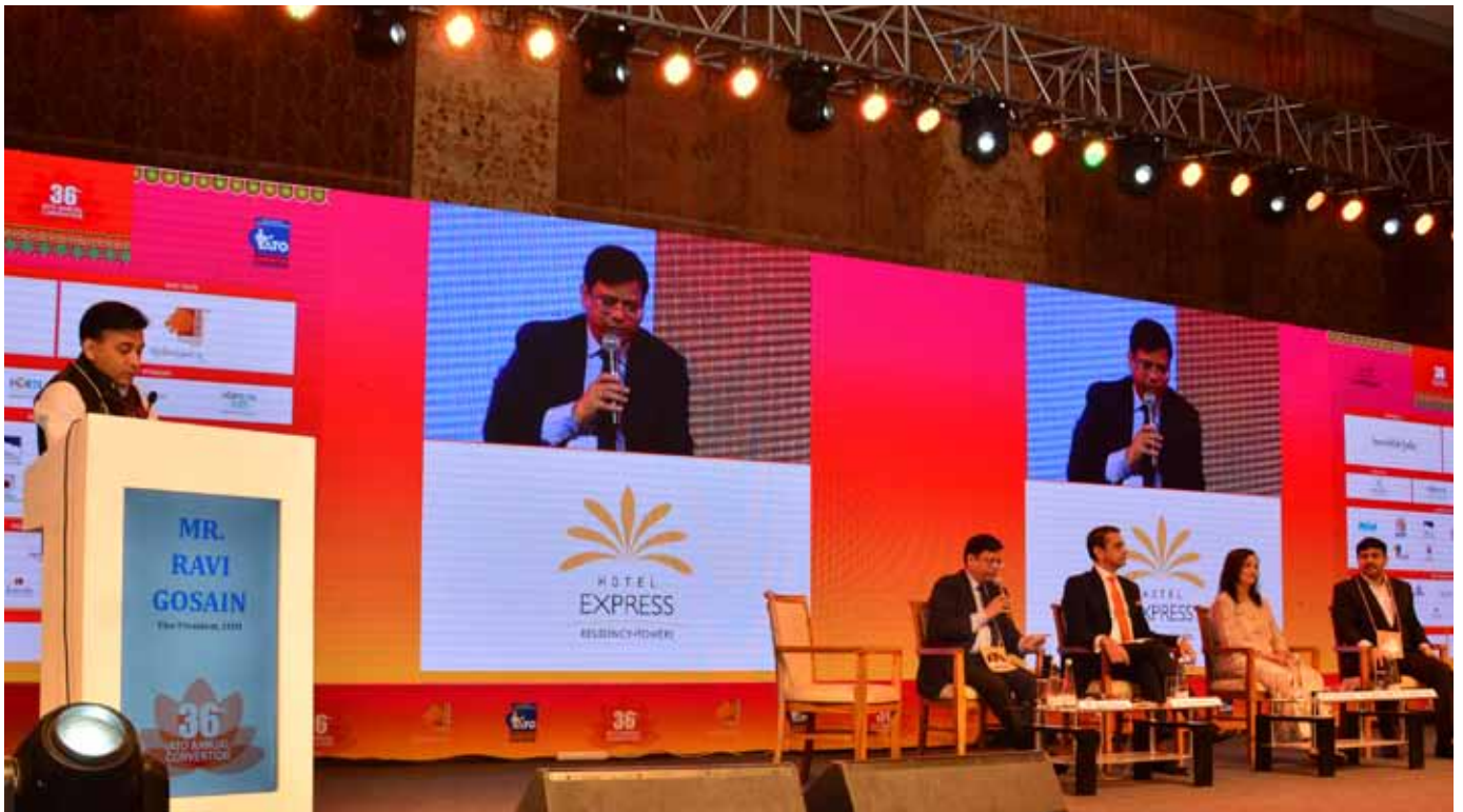
Business session on 'Automation and Digital Marketing'

Digitalisation and automation are the way forward, both for the government to plan targeted campaigns and for tour operators to curate personalised itineraries and offer packages through digital tools without having to exceed costs.