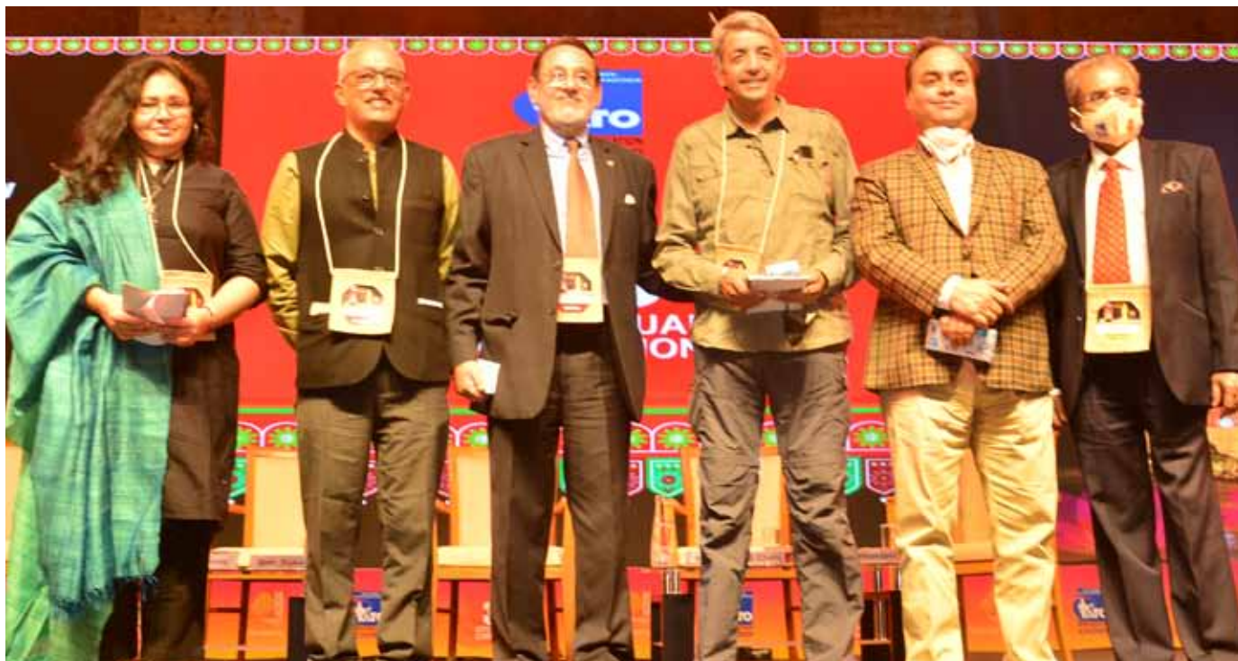
Panel discussion on Responsible tourism

Being responsible in tourism is everybody's prerogative, and the session 'Responsible Tourism' addressed why sustainability is a must to move forward.