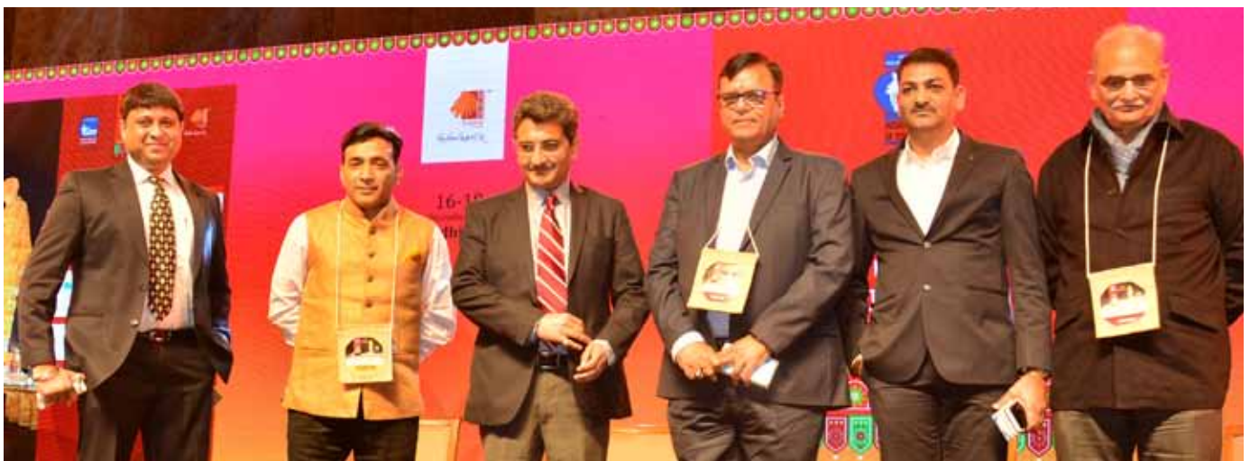
Panel discussion on 'Connectivity: New Frontiers'

With tourism dependent on connectivity, it is vital for IATO members to work alongside Railways, Airlines and Cruiselines to make sure that they can not only better sell these products, but also boost businesses at both ends.