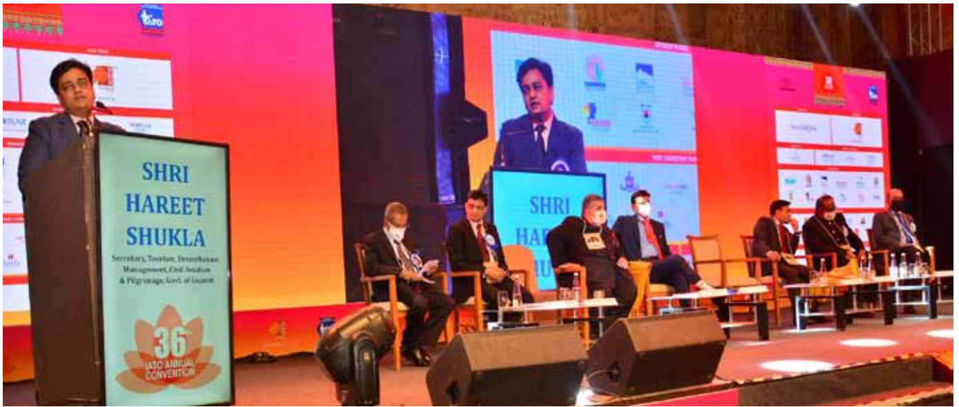
Brainstorming session at the 36th IATO Annual Convention

Assistance scheme for tour operators and will have KITE second edition in June 2022. With the Karnataka Tourism Society (KTS), we are trying to build the confidence of the industry." In terms of new destinations, they have started heli-tourism and are working on coastal tourism. Also, skill development is a focus for them.