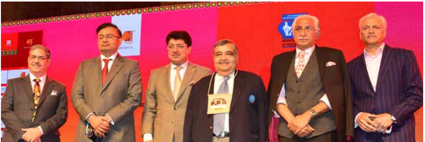
Session on Hotels in the New Normal held at the 36th Annual IATO Convention

The second session, titled 'Hotels in the New Normal', provided an interesting perspective on how hotels navigated the pandemic and how it is now necessary for both hotels and tour operators to collaborate to not only promote India, but also to ensure that everyone gets business.