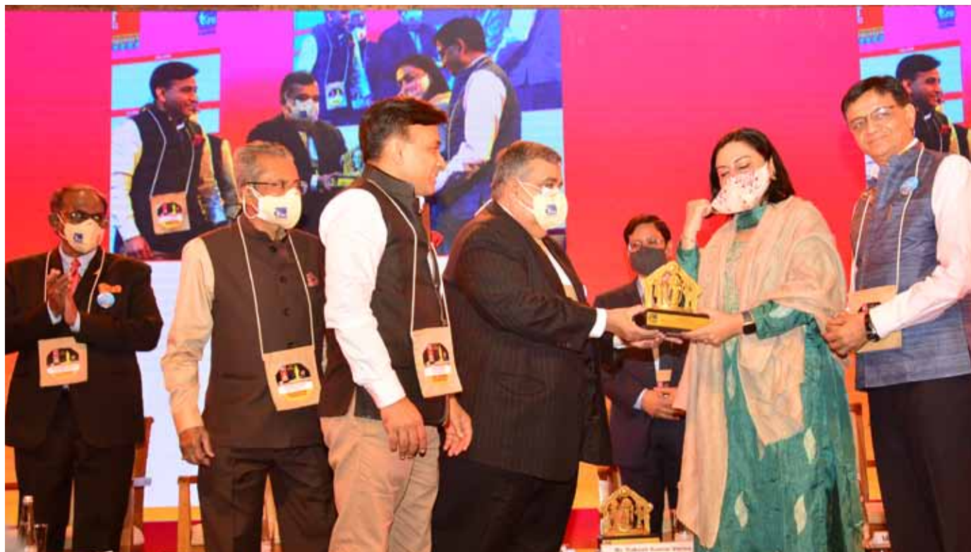
Concluding Valedictory session

The valedictory session of the convention saw in attendance senior members from the Ministry of Tourism as well as Gujarat Tourism, apart from the who's who of hospitality and trade.