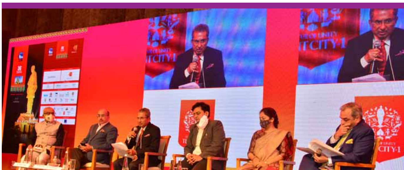
Panel discussion at the 36th IATO Annual Convention

The first panel discussion at the 36 th IATO Annual Convention took the theme head-on and saw both, the governments and private players sharing their views on how they are preparing for a revival strategy while making sure that 'Brand India' remains inviting to foreigners.