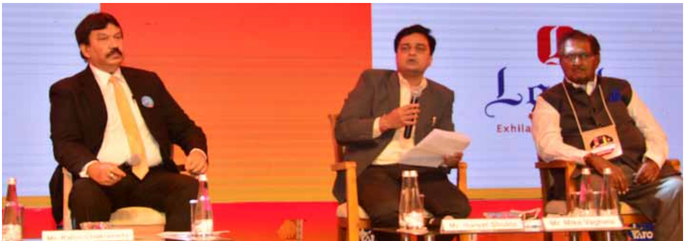
Special session on Gujarat at the 36th IATO Convention in Gandhinagar

Gujarat is coming up as a state with a myriad of possibilities for tourists. Right from sites featuring earliest civilisations, to various heritage sites, to seaplane services and heliports being developed, it has something for everyone.