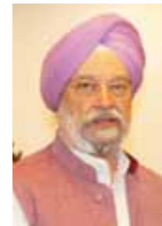
Hardeep Singh Puri