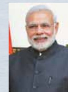
Narendra Modi Prime Minister of India

PM Narendra Modi has stressed the need to focus on festival tourism in India and also urged Indians living abroad to promote traditional festivals. While extending Diwali greetings to the nation, the PM said that our festivals have enormous scope for promoting tourism.