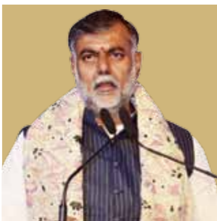
Prahlad Singh Patel

Tour operators and travel agents are an integral part of our industry and we cannot take any step without their support. From the day, I have taken charge of the ministry, we have been working tirelessly to explore new areas of promoting tourism.