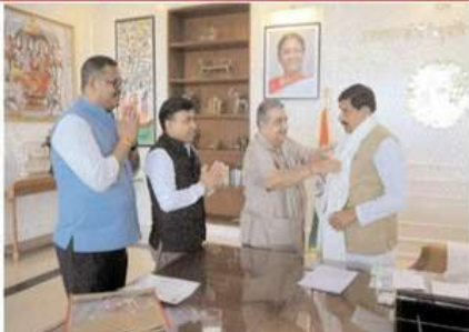
आईएटीओ के प्रतिनिधि मंडल के सदस्यों को मुख्यमंत्री डॉ. यादव ने संबोधित किया।

एनडी, नयी दिल्ली: आईएटीओ का 39वां एनुअल कन्वेंशन 30 अगस्त से भोपाल में होना। भारतीयों को विश्व भर में प्रमुख पर्यटन स्थलों के साथ से जोड़ने के उद्देश्य को लेकर मुख्यमंत्री डॉ. मोहन यादव ने आईएटीओ के प्रतिनिधि मंडल के साथ प्री-कॉन्फ्रेंस बैठक में मुलाकात की। बैठक में डॉ. यादव ने आईएटीओ के प्रतिनिधि मंडल के सदस्यों को संबोधित किया और देश के पर्यटन क्षेत्र के विकास को बढ़ावा देने के लिए आईएटीओ की भूमिका को प्रशंसित किया।